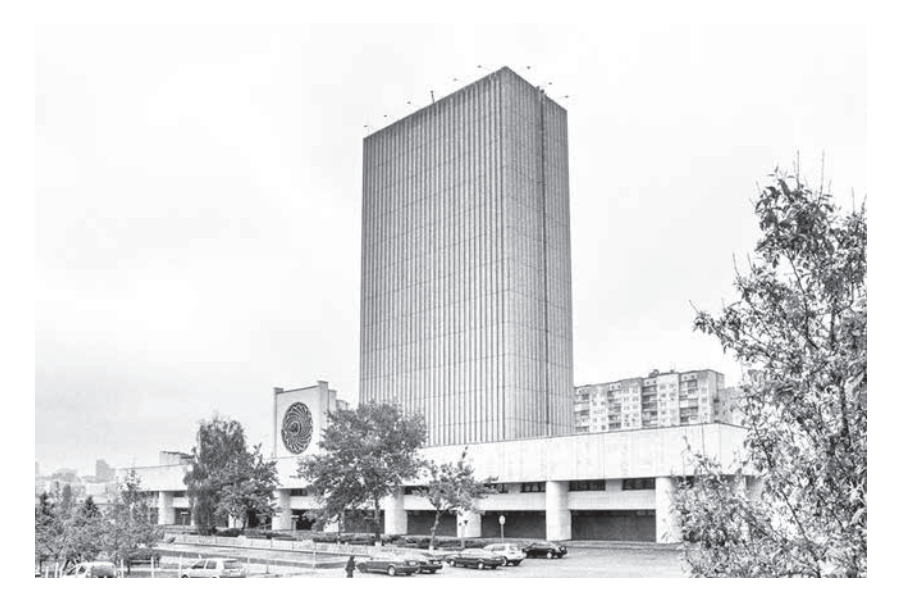
Figure 1 V. I. National Library of Ukraine, Kyiv.

In 1996 the Ukrainian government granted national status to fourteen major libraries in the country. Located in Kyiv, in a twenty-seven-floor building opened in 1989, the most prominent "all-Ukrainian book collection" is the V. I. Vernadsky National Library of Ukraine, which is under the supervision of the National Academy of Sciences of Ukraine, Department of History, Philosophy and Law, and stands as the leading institution engaged in scientific research, including the field of library and information science. Established in 1918, the library is the successor of the National Library of the Ukrainian State in Kyiv. The library, an institution with deep cultural and scientific significance in Ukraine, harbors some 16 million volumes in many languages. The library's collections are considered "national cultural heritage of the Ukrainian people, an integral part of the cultural heritage and is under state protection." The special collections include Slavic manuscripts dating back to the tenth